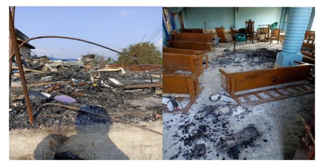
A tribal church in Bishnupur District