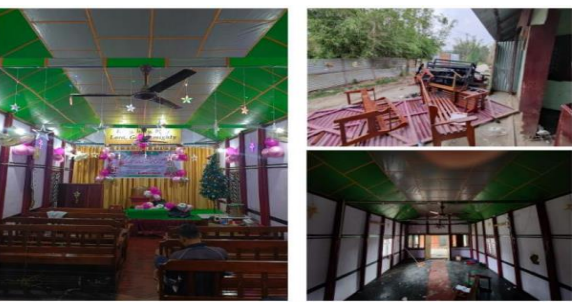
Survivors in Churachandpur